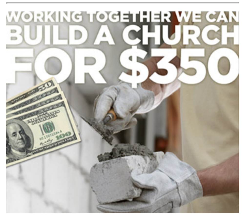
Zambia Church building project funds are coming in »

Change of Date for Aurora Church international food fair » The Aurora Church in Colorado will present the "Taste of The Nations" on Sabbath, June 22. Read more.