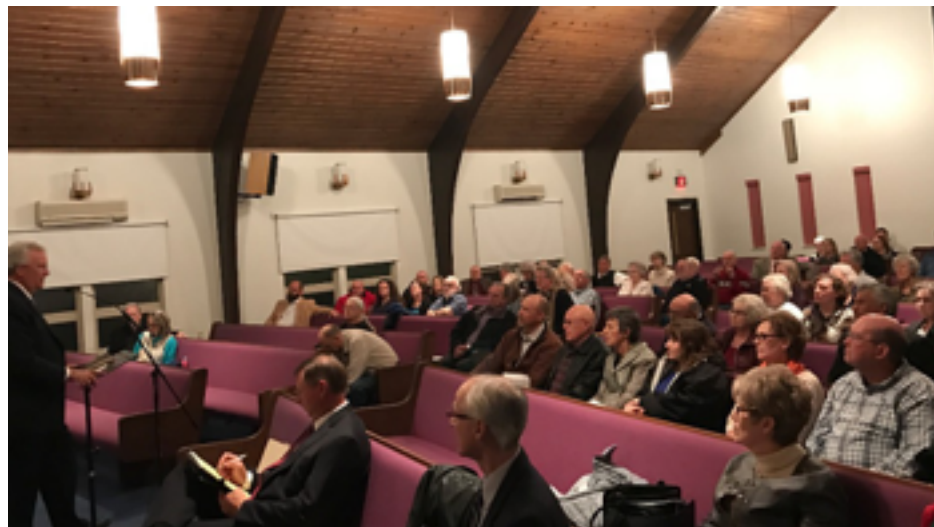
The windy Wyoming weather did not stop the nearly sixty

The purpose of the regional Town Hall meeting during the Constituency Session year is to review the agenda for the upcoming session, discuss issues in advance of the session, such as amendments to Bylaws of the Rocky Mountain Conference, gain input and advice from representatives of the local churches, and elect representatives from the regions to serve on the nominating committee.